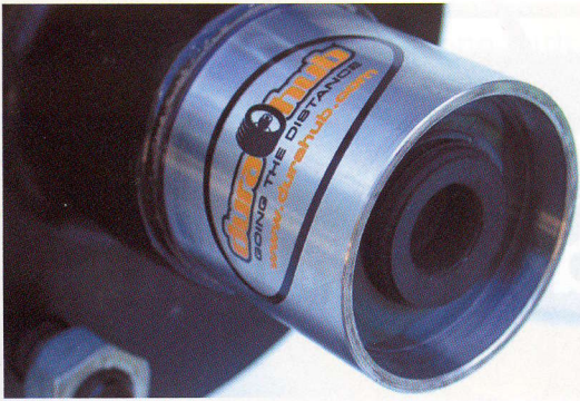
The new oil-based Durahub bearing protector.