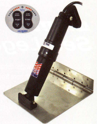
RIGHT: The Lectrotab system suits boats to 50 feet.

Complete kits are stocked to suit boats up to 50 feet, with all components available as spare parts. For more information call (08) 8261 5411.