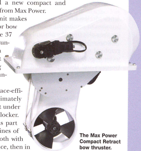
The Max Power Compact Retract bow thruster.

Available in 12 or 24 volt models, the unit is supplied with a control panel and benefits such as an intelligent time delay between port and starboard thrust, childproof activation and a 20 second time delay warning before overheat shutdown. The drive legs are composite, pre-lubricated and sealed for life, meaning they are maintenance free and no anode is required. For further information phone (02) 9981 9550 or visit www.oceantalk.com .